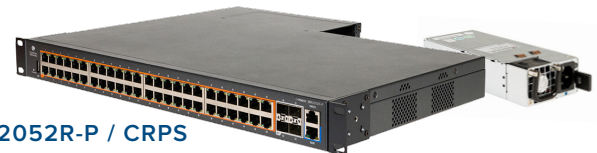
EX2052R-P / CRPS