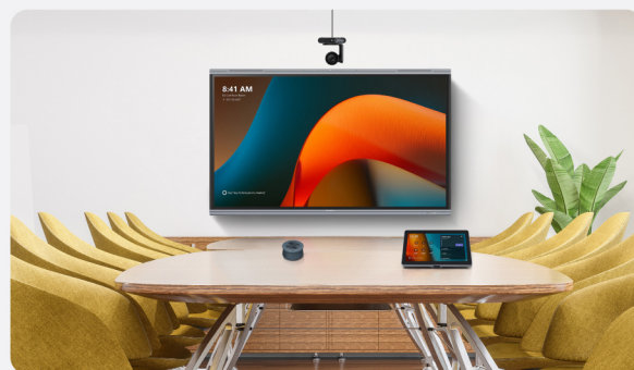
Installation Option B