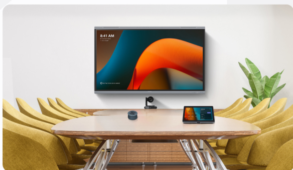
Installation Option A